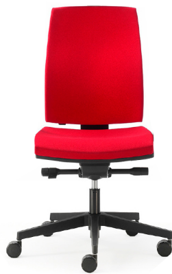
KINETIC High back