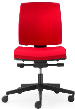
KINETIC Mid back