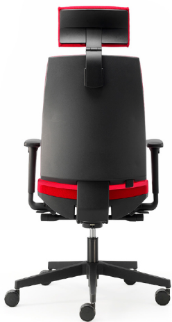
KINETIC High back with headrest