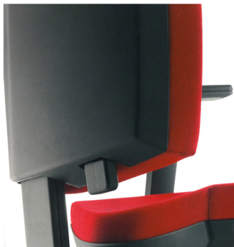
— Unique button back adjustment