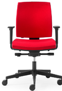
KINETIC Mid back with arms