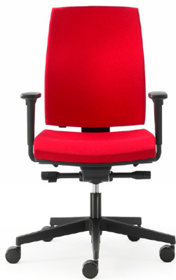
KINETIC High back with arms