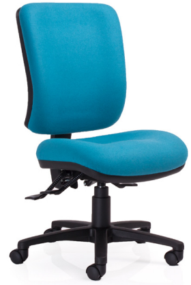
REXA RATCHET High back (MB)