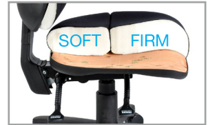
— Rexa Comfort duo