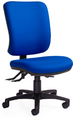
REXA MANUAL High back (MB)