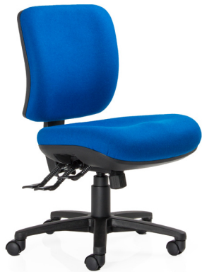
REXA PLUS Mid back (MB)