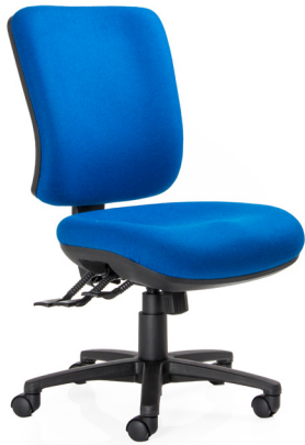
REXA PLUS High back (MB)