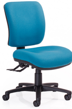
REXA RATCHET Mid back (MB)